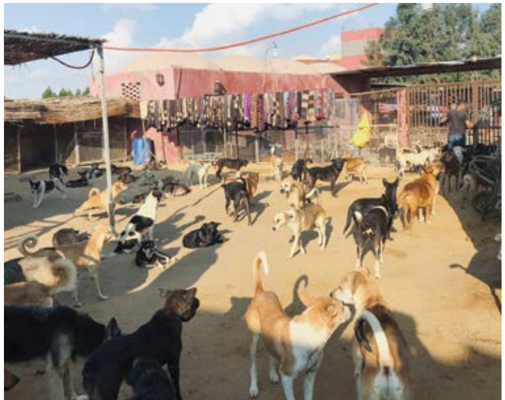
The Animal Protection Foundation

The next day we went to another shelter ~ The Animal Protection Foundation . Hanan, who runs the shelter, takes in mostly injured and sick animals. We were told there were 600+ dogs in her facility. Many had been badly abused. It seems as though people generally make no effort to avoid running over a dog or a