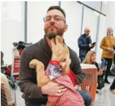
Welcome to Canada Babe #2898!