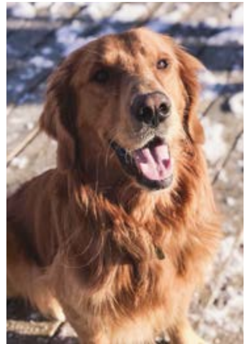
Welcome back to Canada Alex #2889!

We do what we can but it never seems enough ~ what we have seen, both in Canada