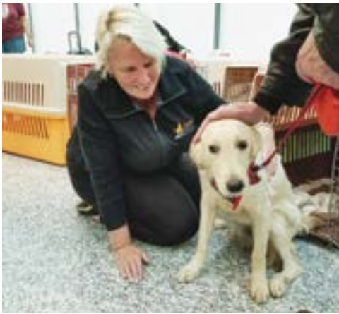
Welcome to Canada Lucy #2895!